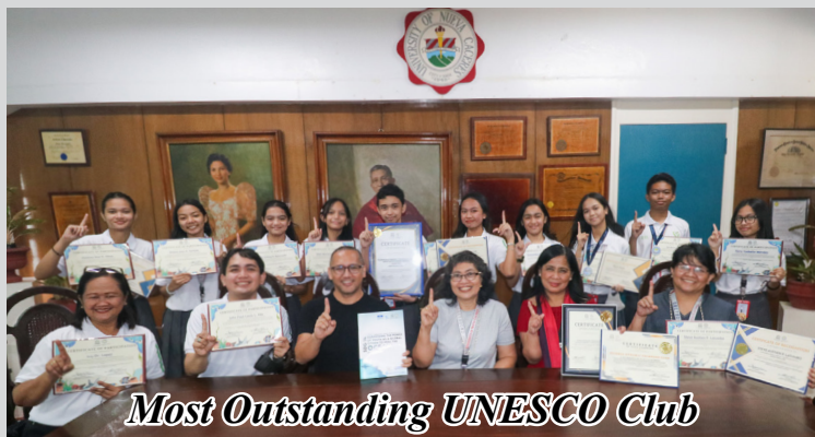
Most Outstanding UNESCO Club

The UNC Science Dynamic Thinkers Club (SDTC) is 2022 Most Outstanding UNESCO Club for High School Level, awarded during the International Assembly of Youth for UNESCO held last December 9-11 at Bayview Park Hotel, Manila.