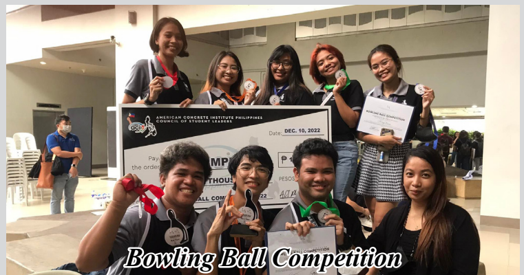
Bowling Ball Competition